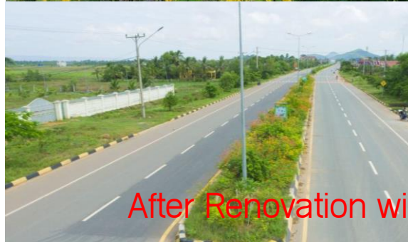
After Renovation with SoLAR lighthening