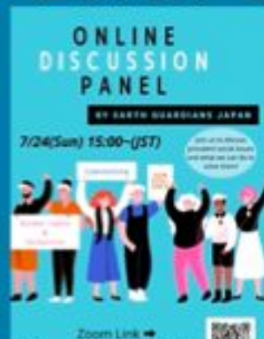
Online Discussion Events