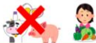
Vegan Food Workshops for Elementary Schools