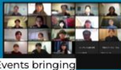
Events bringing together Politicians and Students