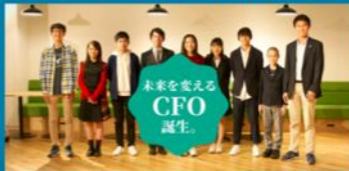
First Generation Future Summit