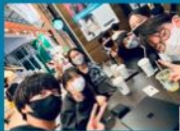
Creating a Internship Programme for Highschool Students