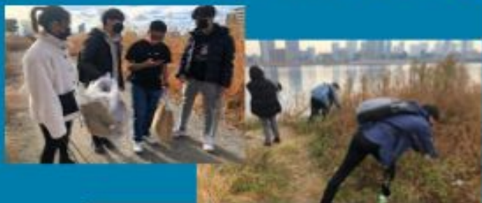
Cleaning up Yodogawa