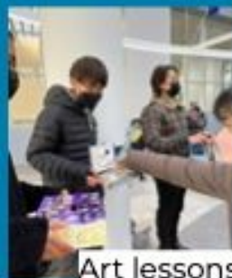
Art lessons for Elementary School Students to benefit Tonga Earthquake Relief