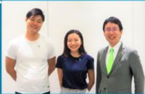
First Generation CFO