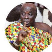
Keynote Speaker Osagyefuo Amoatia Ofori Panin Okyenhene King of Akyem Abuakwa of Ghana