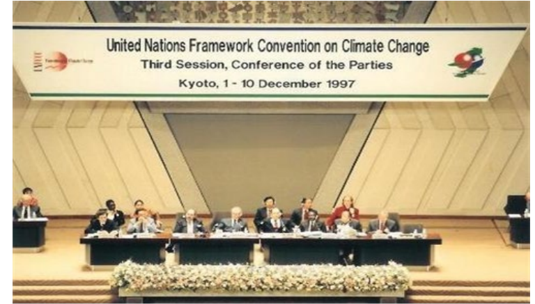
COP 3 (1997)

⇒菅首相「2050年ゼロ」を表明 PM Suga declares "Zero"