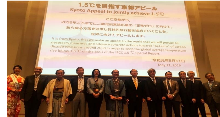
Kyoto Appeal to jointly achieve 1.5℃ (2019)