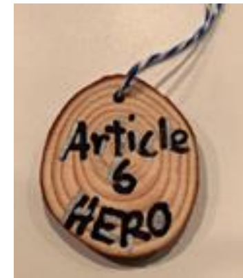
Article6 Hero Medal