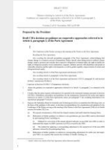
Ver2 (11 Nov)