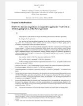
Ver4 (13 Nov)