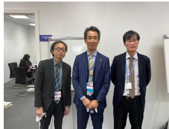
Article 6 experts in Japanese delegation