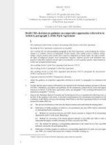
Ver2 (5 Nov)