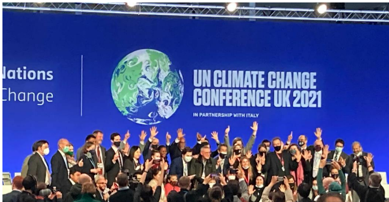
Article 6 family photo

Art6.8 Work programme under the framework for non-market approaches