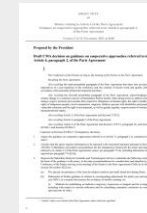
Ver3 (12 Nov)