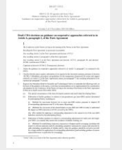
Ver3-4 (6 Nov)