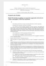
Ver1 (10 Nov)