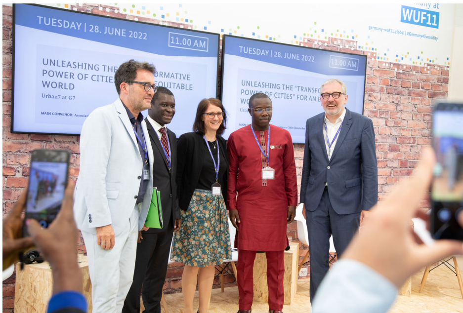
Photo: Germany at WUF