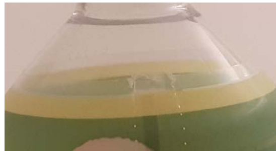
Perforation on the labeling of PET bottle.

This voluntary standard in Japan followed the enactment of the Container and Packaging Recycling Law, which applies extended producer responsibility (EPR) to manufacturers and importers.