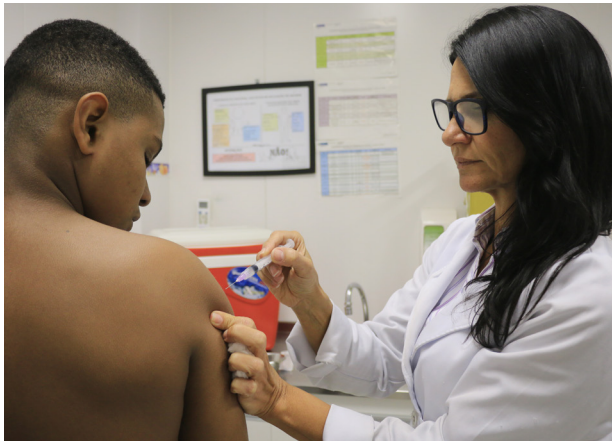
Basic Health Unit vaccination campaign.