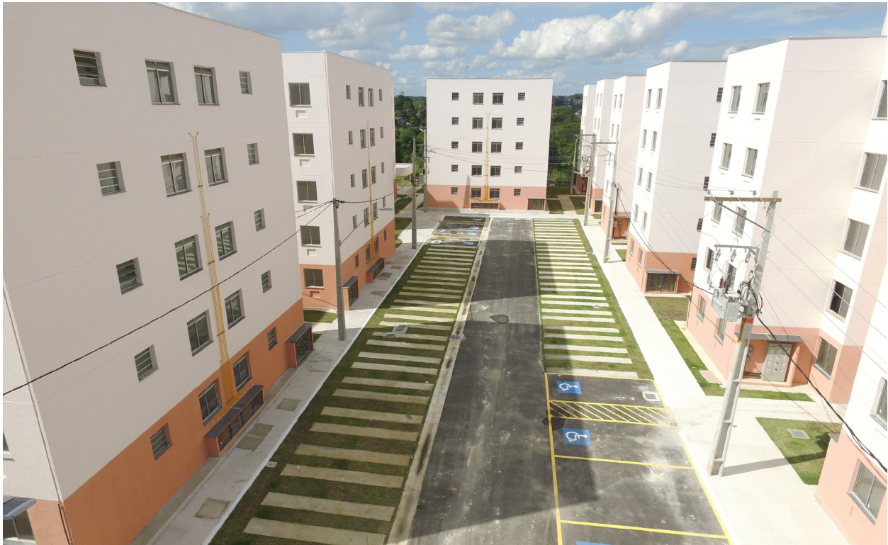
New housing units built.

has been carried out for the elaboration of projects of Technical Assistance in Housing of Social Interest - ATHIS.