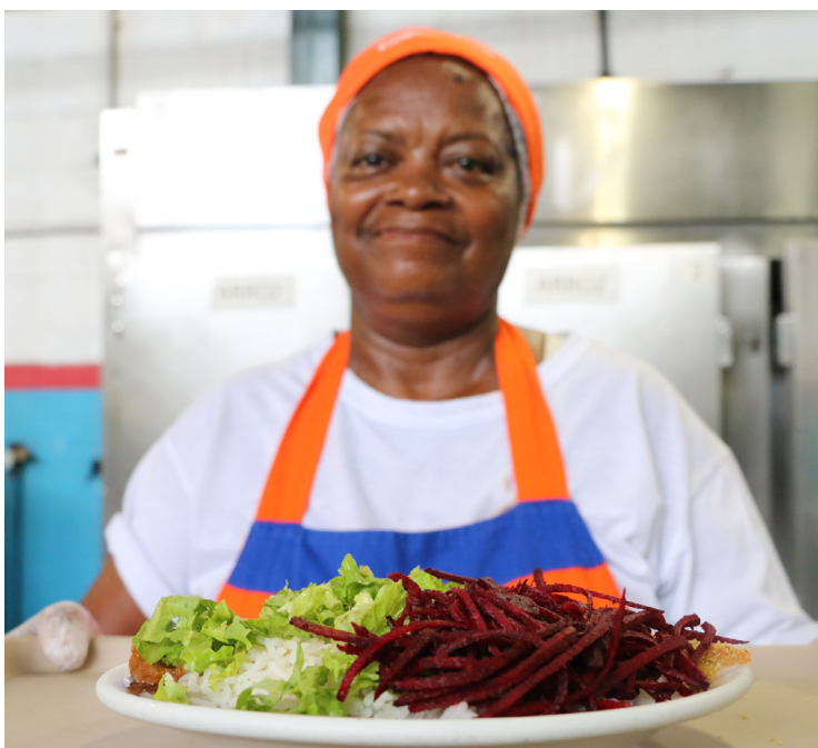
Meal served at the Popular Restaurant Citizen Jorge Amado.