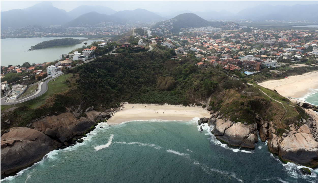
Aerial photo of the Municipality of Niterói.

Plan 3 , which emphasizes the participation of society in planning the next 20 years and the preparation of the city for current and future challenges. Part of the Plan is the formulation of the Commitment to the Results Program, which promotes, through indicators, an organizational adherence to short, medium- and long-term instruments that strengthen the municipality's capacity to monitor, evaluate and improve its public policies through seven result areas :