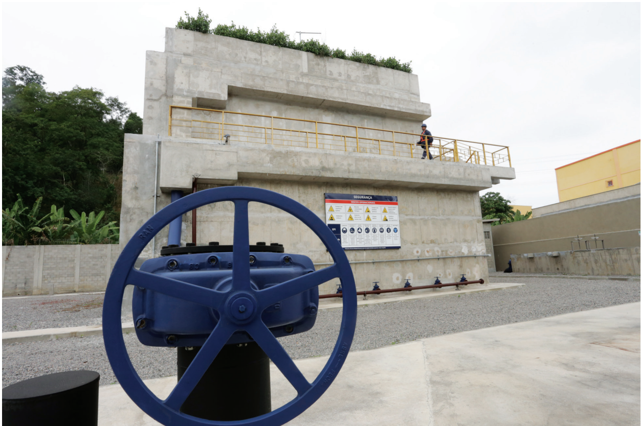
Sewage Treatment Plant (ETE) Maria Paula.