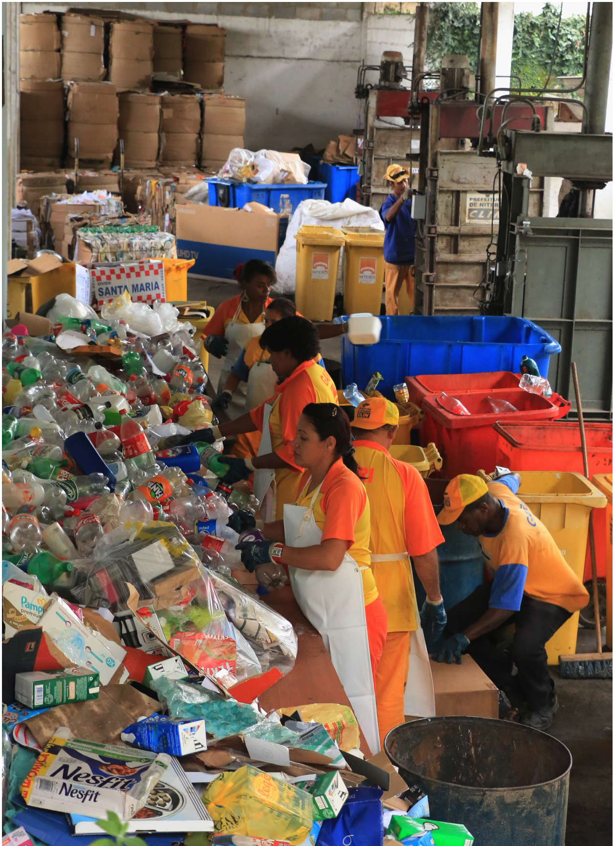
Niterói Cleaning Company's performance (CLIN) on Recycling Programme.