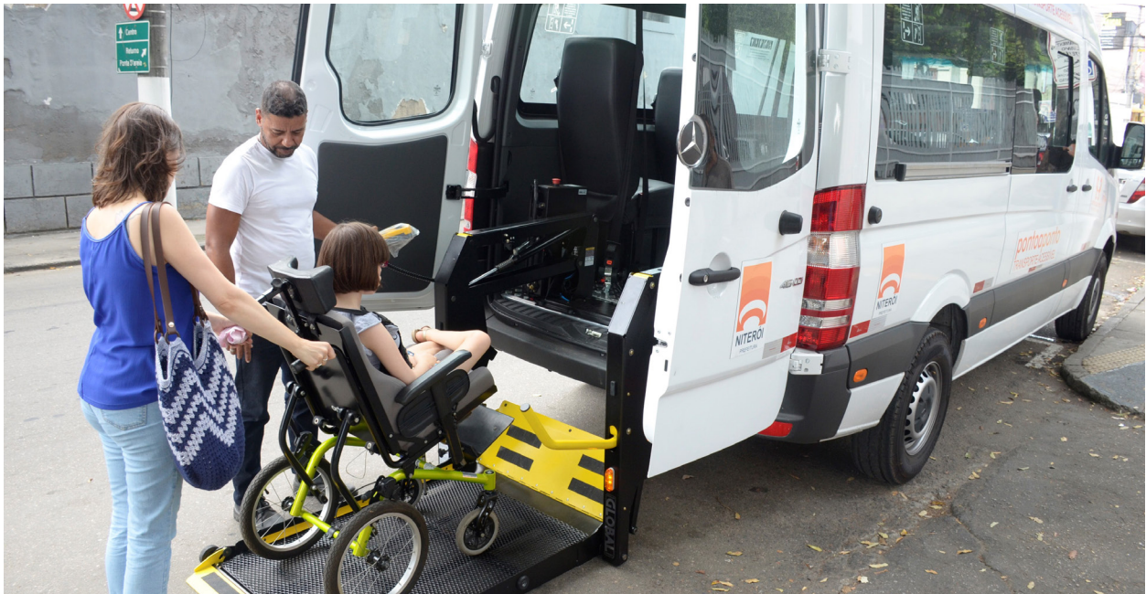
Programme Point to Point.