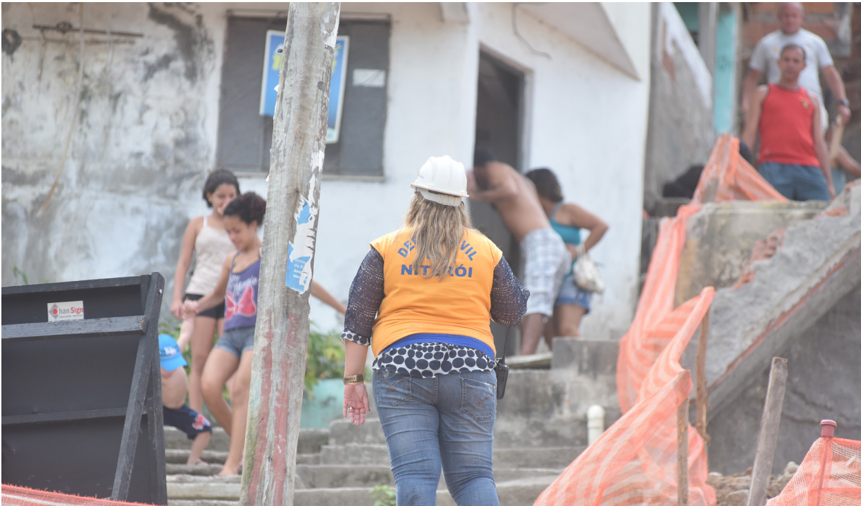
Civil Defense Action to implement the Most Resilient Niterói Plan.

the condominiums. Occurrences such as cracks, fissures due to inadequate works, fires, gas leaks and strong winds are being identified in an initial project involving 36 city landlords, in residential condominiums, horizontal and vertical, of all income levels, for a Civil defence action program. There is a group created for communication with each condominium in order to create a system to prevent and combat risks, managed by the meteorological service.