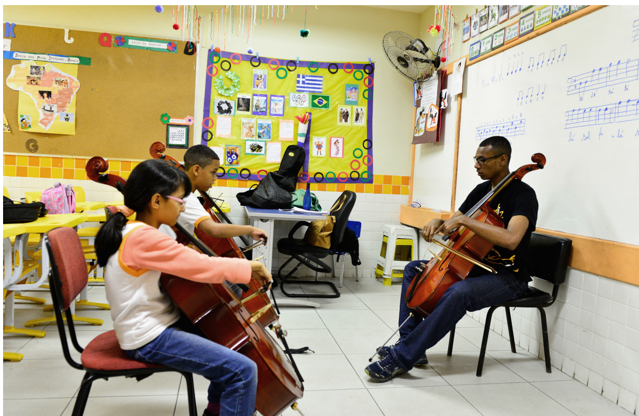
Programa Aprendiz – Music at School.

The Apprentice program is a public musical education program for children and teenagers, the result of a cooperation