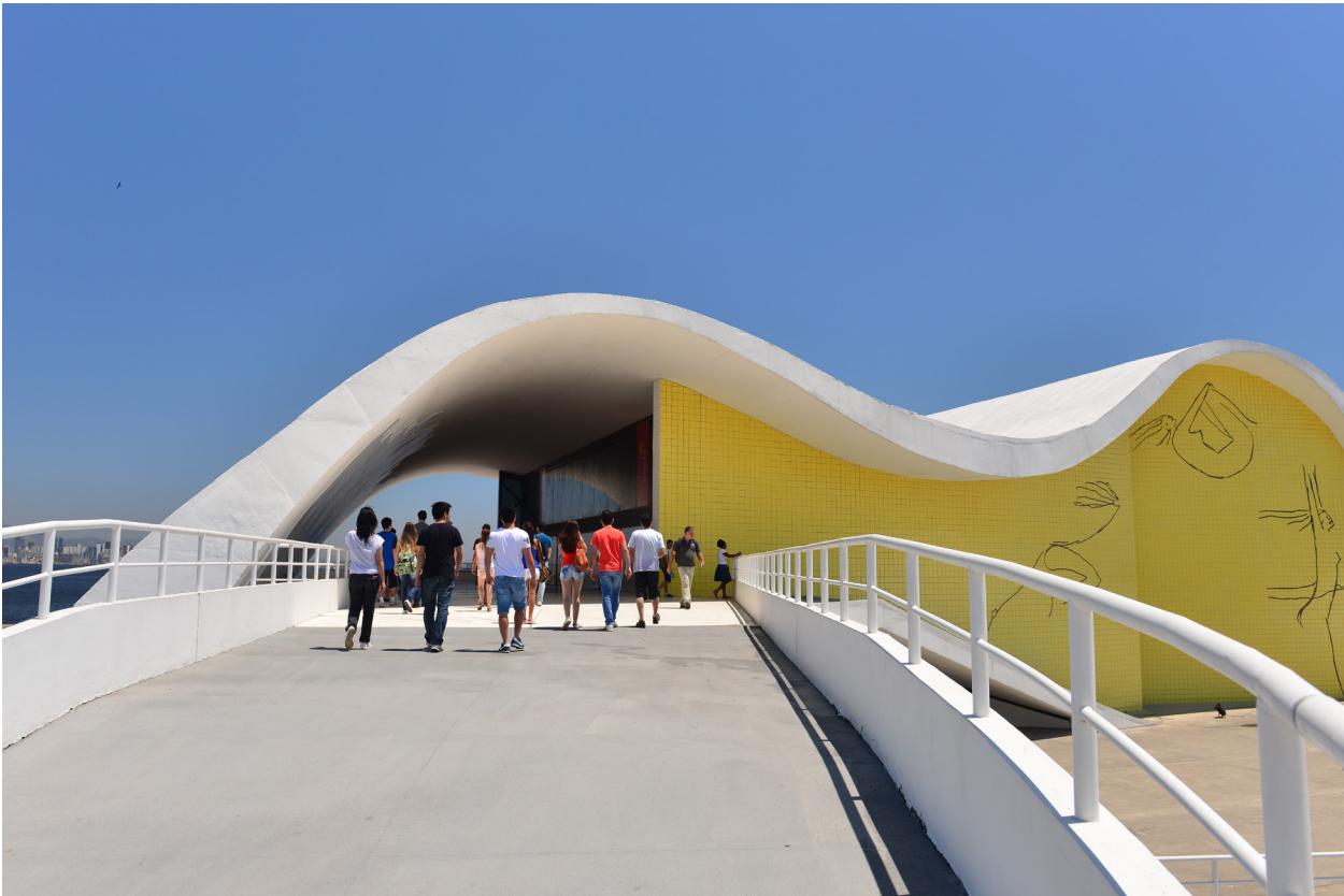
Popular Theatre Oscar Niemeyer.