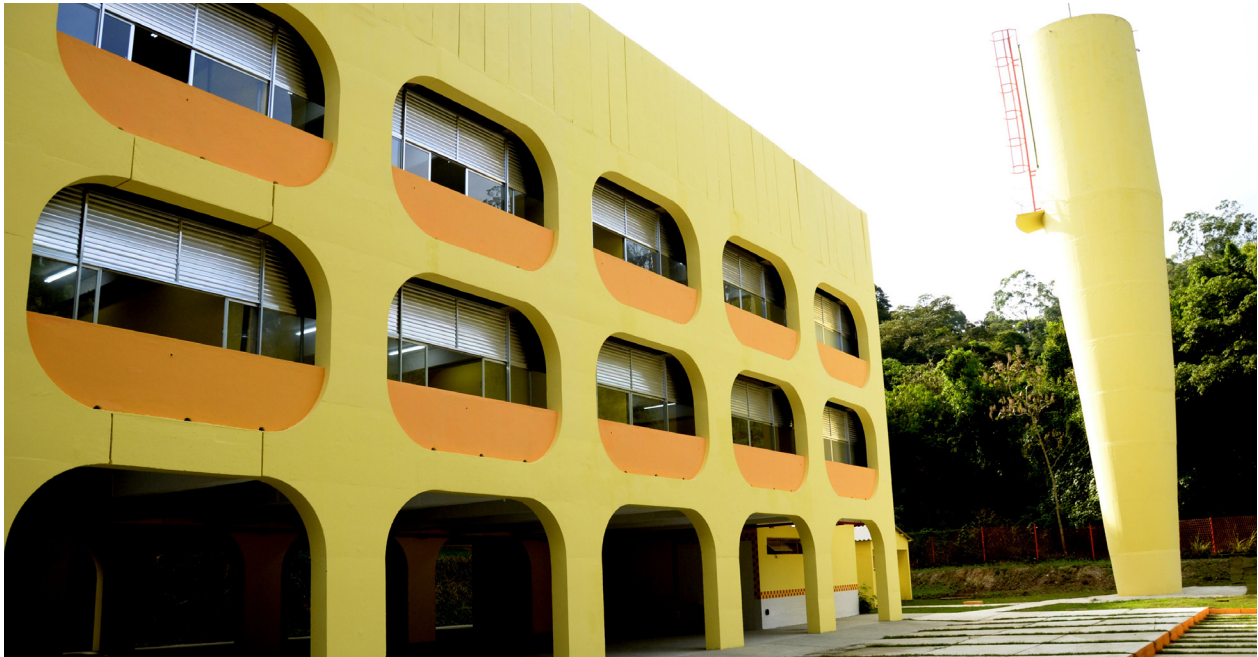
CIEP Esther Botelho Orestes refurbished.