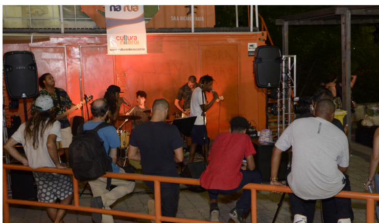
Workshop of Programme Arte na Rua (Art on the Street).

Through the Decree 12903/2018, the Niterói City Government instituted the installation and the use of temporary extensions of public sidewalks by the parklets 18 , with the objective of increasing the pedestrian flow, improving the safety of the sidewalks