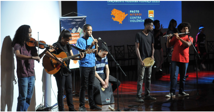
Launching of Programme Poupança Escola (School Savings).

Students from the municipal, state or federal public network of Niterói who are attending the 9th grade of elementary school or any of the grades of regular high school or integrated vocational education are included in the program. In 2019, in its 1st phase, the program reached 150 students. The goal is to reach 400 students in 2020 and 2,000 students in 2021.