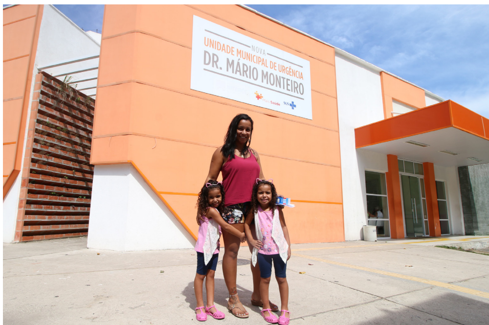
New Municipal Emergency Unit Dr. Mário Monteiro.

The project proposes an innovative approach to reduce the transmission of Dengue, Zika and Chikungunya viruses by releasing the Aedes aegypti mosquito with the Wolbachia bacteria. The project is part of an international initiative, the non-profit program Eliminate Dengue: Our Challenge, which is conducted in Brazil by the Oswaldo Cruz Foundation (Fiocruz) and has 4 main activities: communication of the project; community engagement; release of the Aedes aegypti mosquito with Wolbachia; and monitoring, to verify the presence of