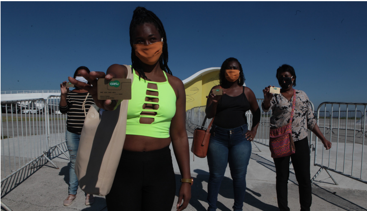
Citizens receive social card for assistance from the Basic Income program.