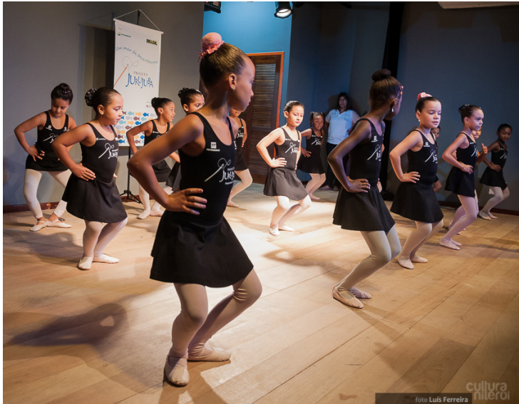
Class at City Ballet Company.

will be restored on four beaches. In Morro da Viração, besides the restoration of 86 hectares of dense ombrophiles vegetation, the management and harvest of an old eucalyptus plantation will be adopted, with subsequent restoration of the area through palm heart trees and the reintroduction of the Juçara palm tree, native to the Atlantic Forest, which feeds 70% of the local marine fauna. The project foresees the purchase of seeds from traditional communities and family farms to strengthen the local productive chain and social inclusion by hiring traditional communities as labour for the planting.