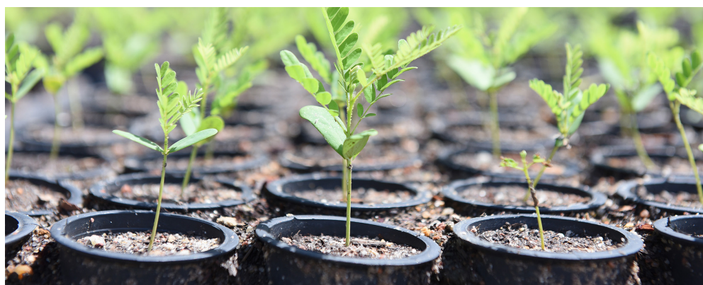
Seedlings for planting – Programme Niterói Mais Verde (Greener Niterói).