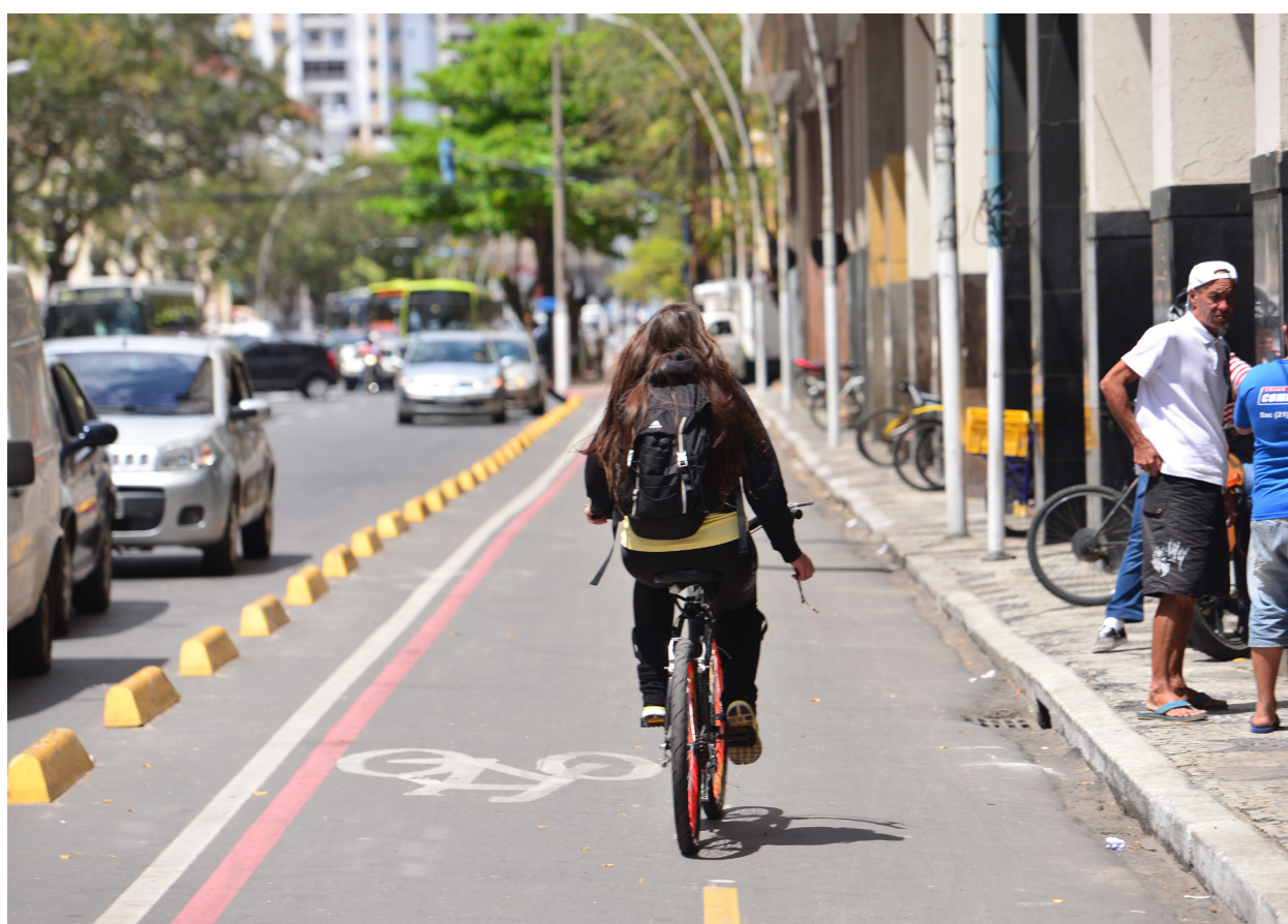
Ernani do Amaral Peixoto Avenue Bicycle path.

However, the city has made important achievements in recent years from the point of view of strategic project execution and planning. Infrastructure projects essential for improving the efficiency of public transport and the bicycle path system have been implemented, as well as solid participatory processes that culminated in the preparation of structural plans for the development of mobility policies (approval of the Master Plan in 2019 and the development of the Municipal Sustainable Mobility Plan).