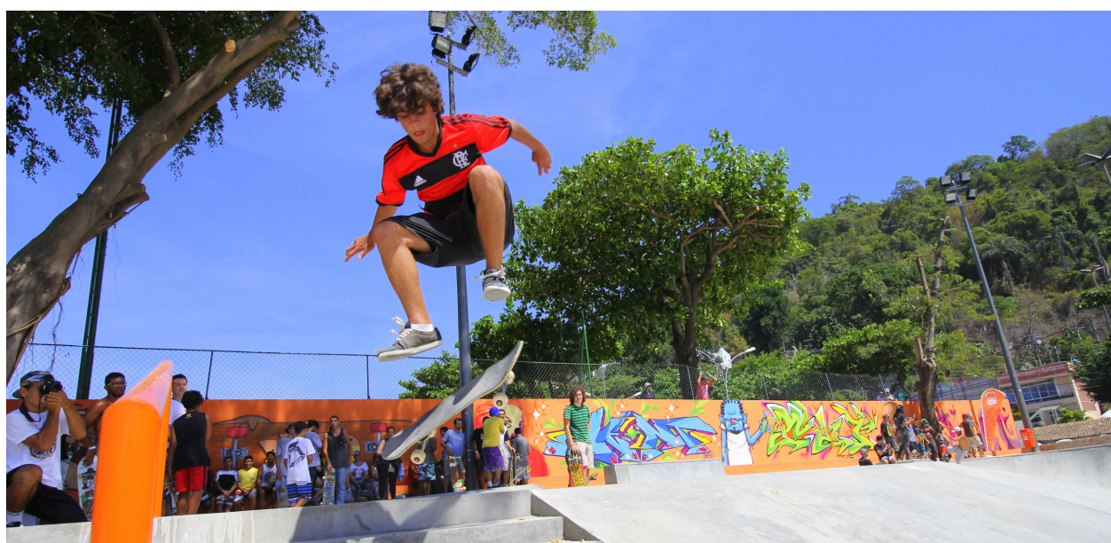
Skatepark Carlos Alberto Parizzi.

More than 150 leisure and living areas have been implemented and revitalized since 2013, such as Horto da Fonseca, Praça Dom Navarro, Praça Boa Vista, and Horto do Barreto, many of them through the Present City Government program. In 2017, the