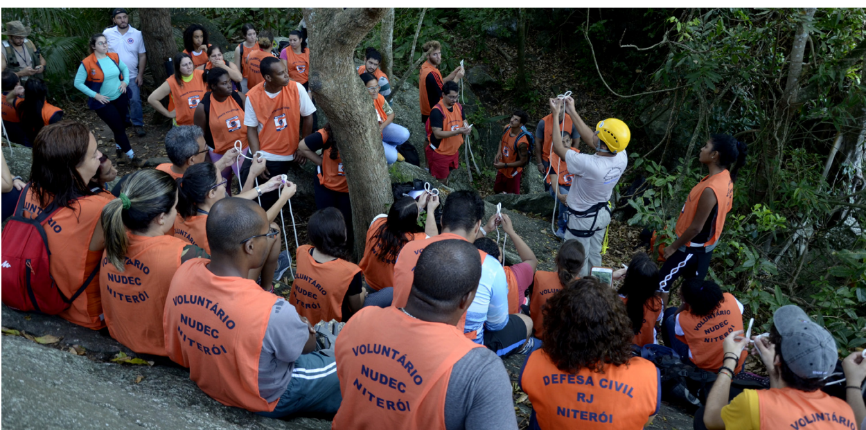
Training of Community Civil Defence Units (NUDECs).

By 2020, 2300 volunteers have undergone a training process that includes first aid and domestic accidents to learn how to proceed in case of heavy rains when living in hillside areas and how to guide their neighbours to the perception of geological risks and the warning and alarm system. This represents an advanced extension of civil defence in case of emergencies, acting in different points of the city. For each of the 100 groups created, there is a specific WhatsApp group that follows the demands of the community every day and informs them about the