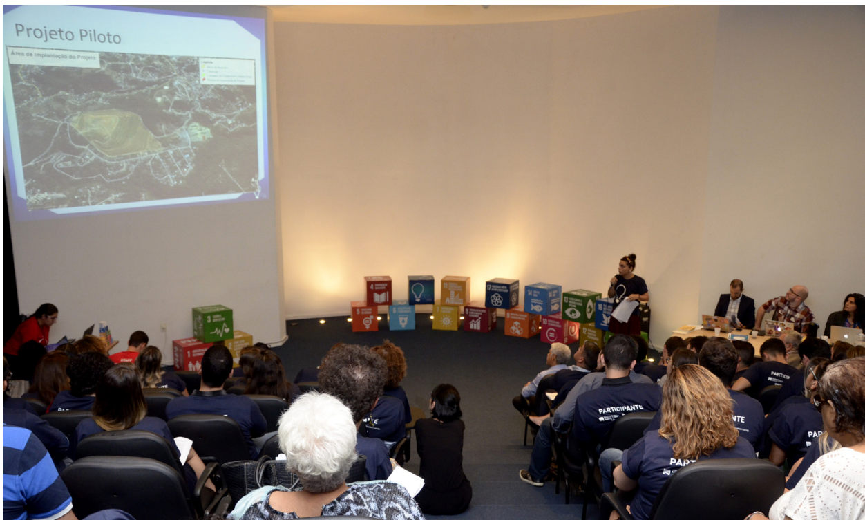
Project presentation at SDG Week by municipal civil servant.

up-to-date is a central theme. WeGov, the public sector innovation start-up, highlights that the skills needed for innovation are curiosity, insurgency, data literacy, storytelling, user focus and interaction 4 .