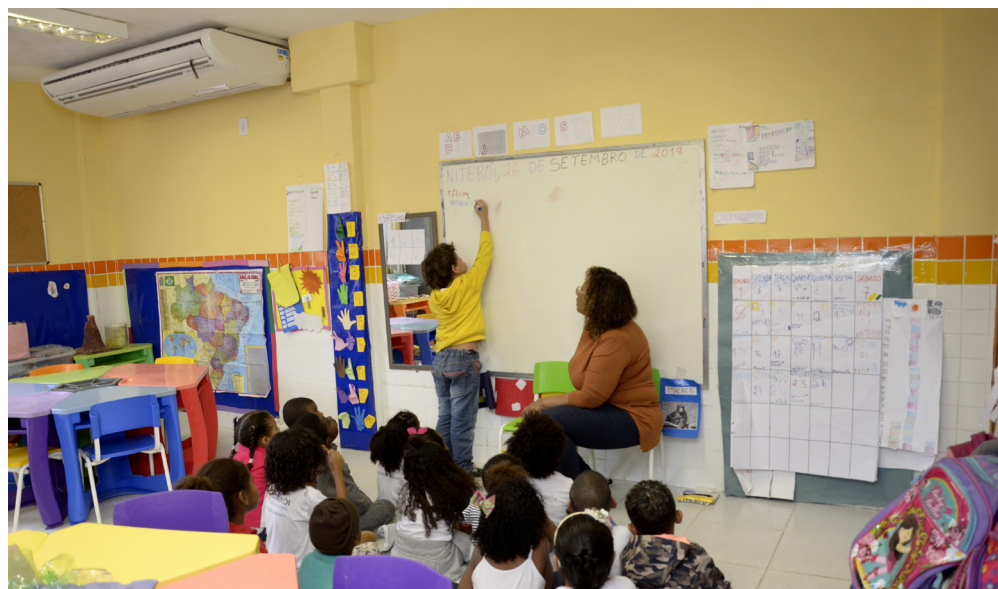
Air-conditioned Municipal School Professora Regina Leite Garcia.

Between the years 2014 and 2019, 6,167 students were included in the learning acceleration program.