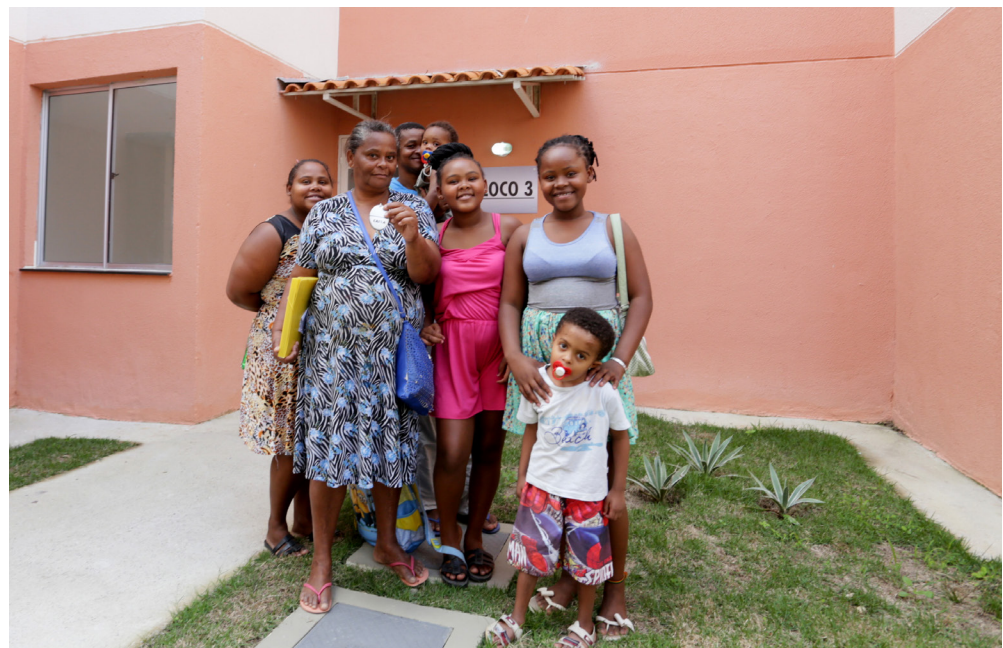
Housing units delivery in Caramujo.

In addition to the achievements in the housing area, the new Municipal Master Plan, approved in 2019, has approved of a new legal framework focused on the right to the city and the fulfilment of a property's social function. There is now the challenge of concluding the ongoing processes and applying the urbanistic instruments to the territory, so that the city can reverse the historical process of socio-territorial segregation that has characterized the urban development of Niterói and most Brazilian cities.