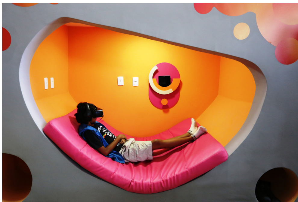
Virtual reality activity on the Engenhoca Platform.