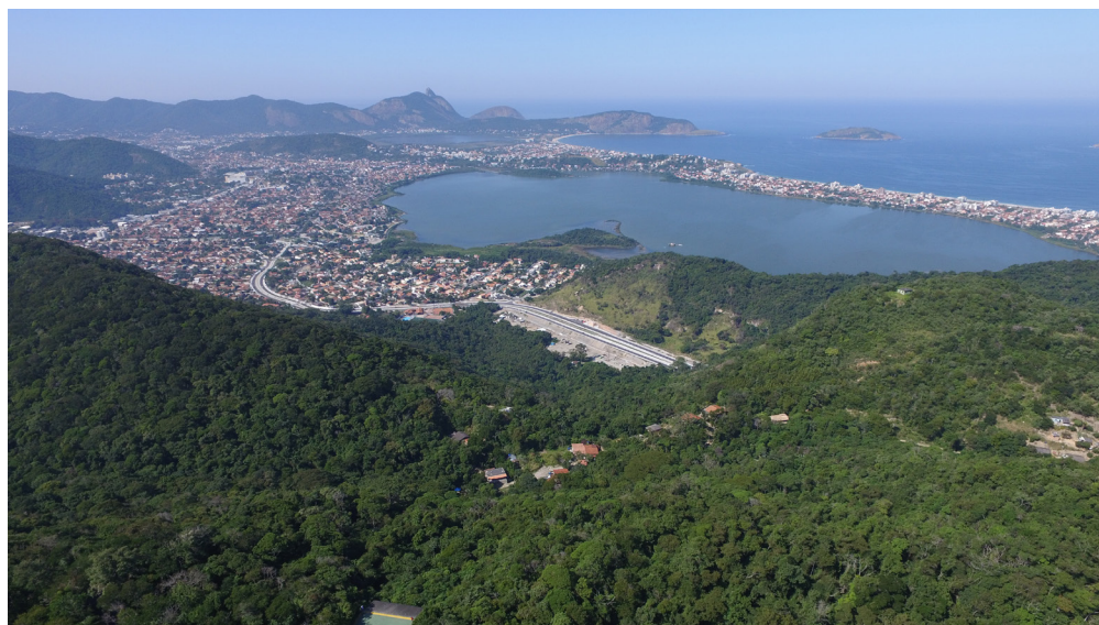
Itaipu-Piratininga Lake (PRO-Sustentável).

In 2017, the Municipal Department of Environment, Water Resources and Sustainability of Niterói (SMARHS) started a project for the restoration of 203 hectares of local Atlantic Forest through financing R$ 2.836 million with non-refundable resources from the BNDES Social Fund. The project includes the restoration of 31 hectares of vegetation on four islands in the municipality and 65 hectares of mangrove forest around the Itaipu Lagoon. In the Permanent Preservation Area (APP), for which responsibility is shared between the city and the Union, 21 hectares of restinga vegetation