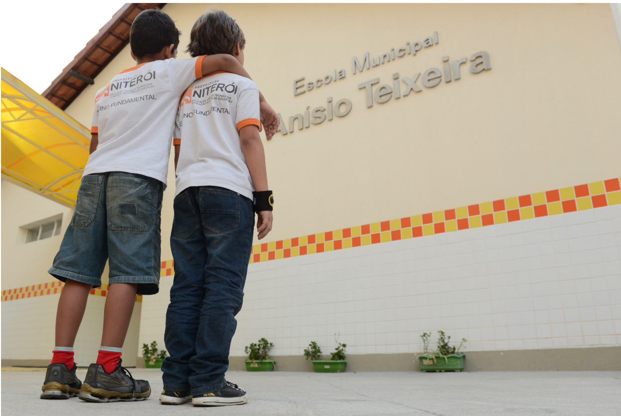
Students at Municipal School Anísio Teixeira.