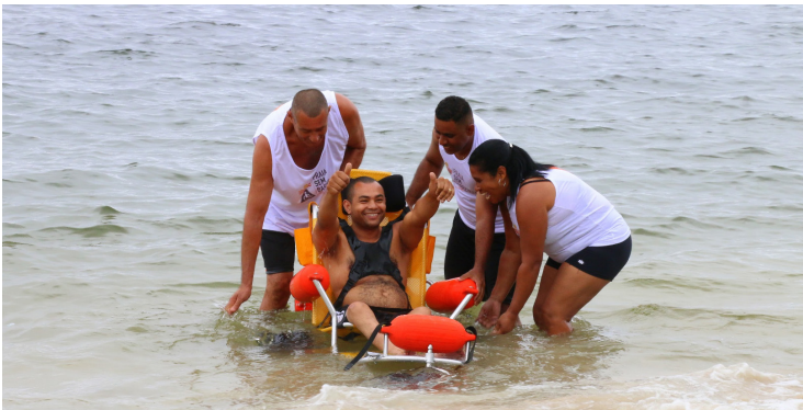
Project Beach without Barrier.

The Gugu Project offers free activities for seniors in Niterói. The project turned 24 years old in 2019, serving about 2 thousand people a day. The program has 37 gymnastics centres, 2 ballroom dancehalls and 1 choir, spread throughout several neighbourhoods in Niterói, with approximately 6 thousand registered participants. On 19 August 2019, the project was declared Immaterial Heritage of the State of Rio de Janeiro.