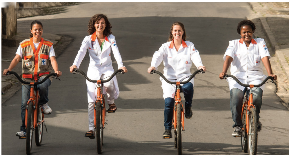
Professionals of the Family Medical Program.

It is also worth mentioning the management's effort to invest in strategic focuses such as the Family Medical Program, basic health care and management without outsourcing, as well as promising actions in the area of sanitation (described in the analysis of SDG 11), which are directly linked to the population's health and involve, above all, investment in Sewage Treatment Plants and the structuring of the Municipal Sanitation Plan.