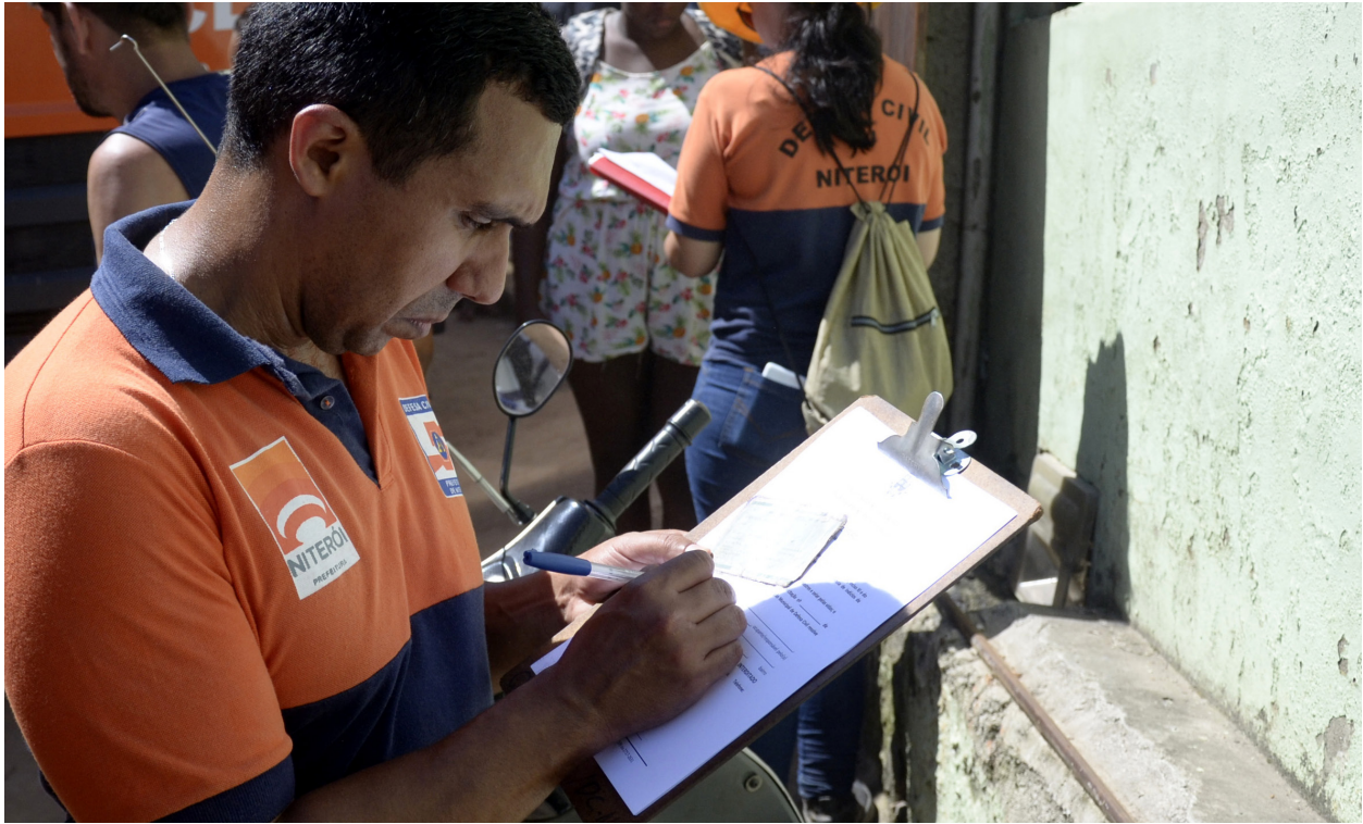
Civil Defense action for risk reductions.