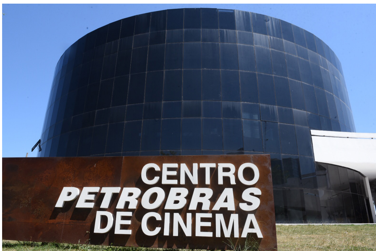
Cinema Centre Petrobrás.

The agreement with UNESCO, entitled 'Promotion of the sustainable development of the material and immaterial heritage in Niterói, was initiated in 2019 and is expected to last for three years. The agreement acts on three main axes (i) tangible and intangible cultural heritage; (ii) artistic and cultural production, creative economy and artistic and cultural rights; (iii) training, qualification and education, and will direct R$ 8.5 million to respond to the fulfilment of the SDGs in joint action by the secretariats of culture, education and tourism. The agreement foresees, among other things, the recognition of works by architect Oscar Niemeyer in the municipality as cultural heritage by UNESCO.