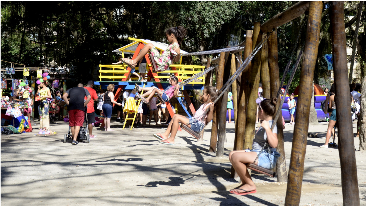
Children's Day at Campo de São Bento.