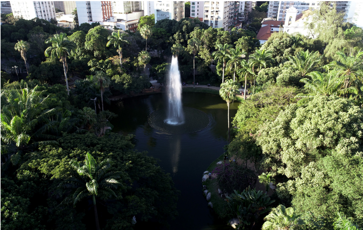
Aerial photo of Campo de São Bento.

Parque das Águas was reopened, and since 2018 new squares have been built in the districts of Fátima, Fonseca, Boa Viagem and Piratininga and revitalizations in Icaraí and Ponta D'Areia. Two Skateparks have also been implemented, one of them with the third largest track in Brazil. Currently, the JK Square in Cento de Niterói, designed by architect Oscar Niemeyer, is being revitalized by the city government.