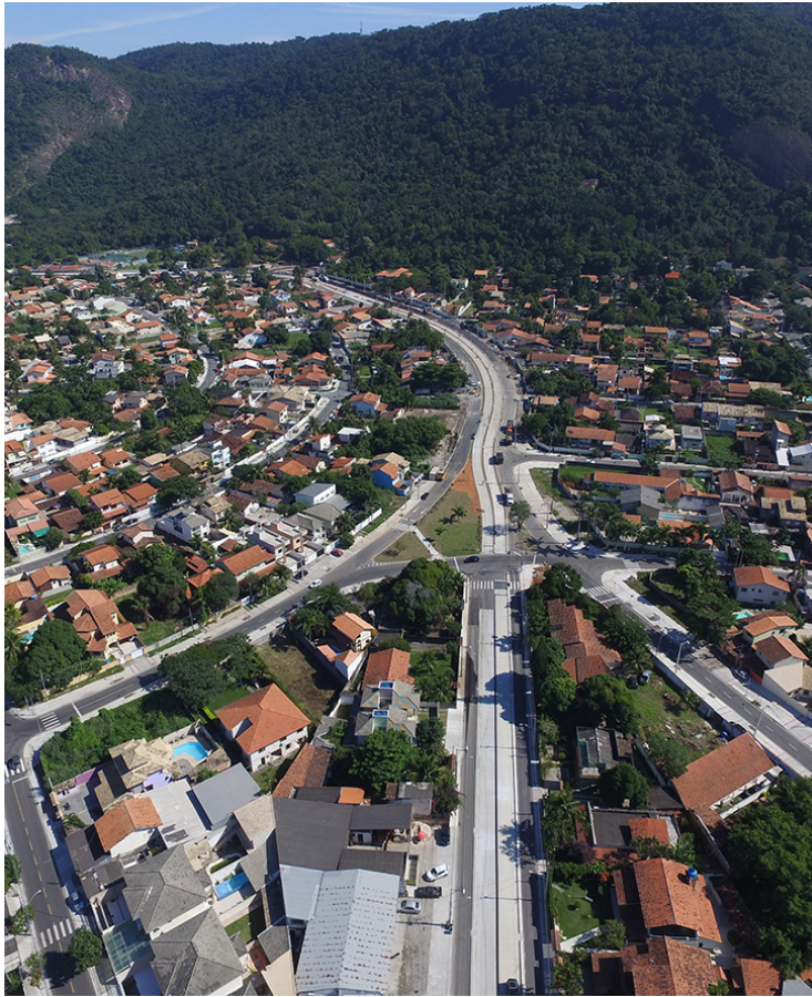
Aerial photo of the construction of Transoceanica.

in Niterói in the road structure that provided more fluidity, comfort and safety to the commuting population, such as the construction of the TransOceânica and the Charitas-Cafubá tunnel in Serra do Preventório (detailed below), which allowed faster commuting between the Oceânica Region and the centre of Niterói; the Renascença Square tunnel located in downtown, which aimed to relieve the traffic of public transport from the João Goulart Terminal, and the development of the expansion, re-urbanization and widening of Marquês do Paraná Avenue, an important route that connects the downtown area to the South Zone of Niterói.