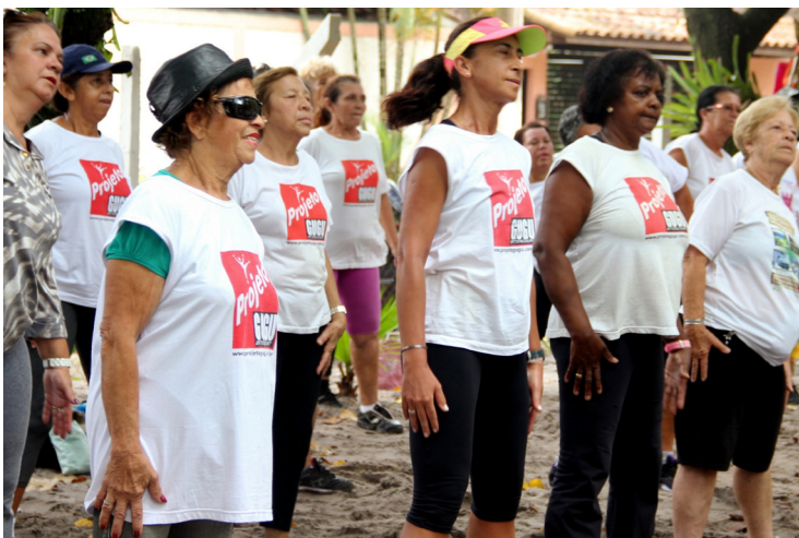
Elderly at class of Project Gugu.