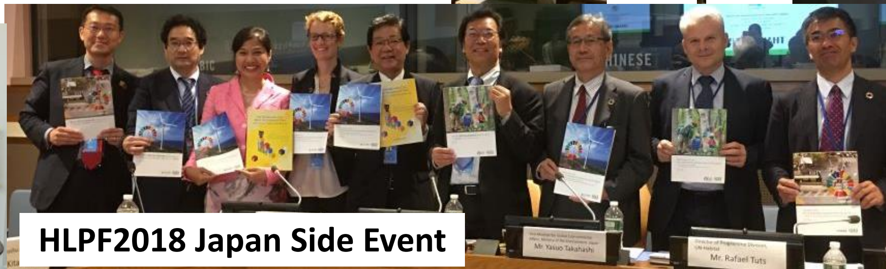
Bernadia UCLG ASPAC