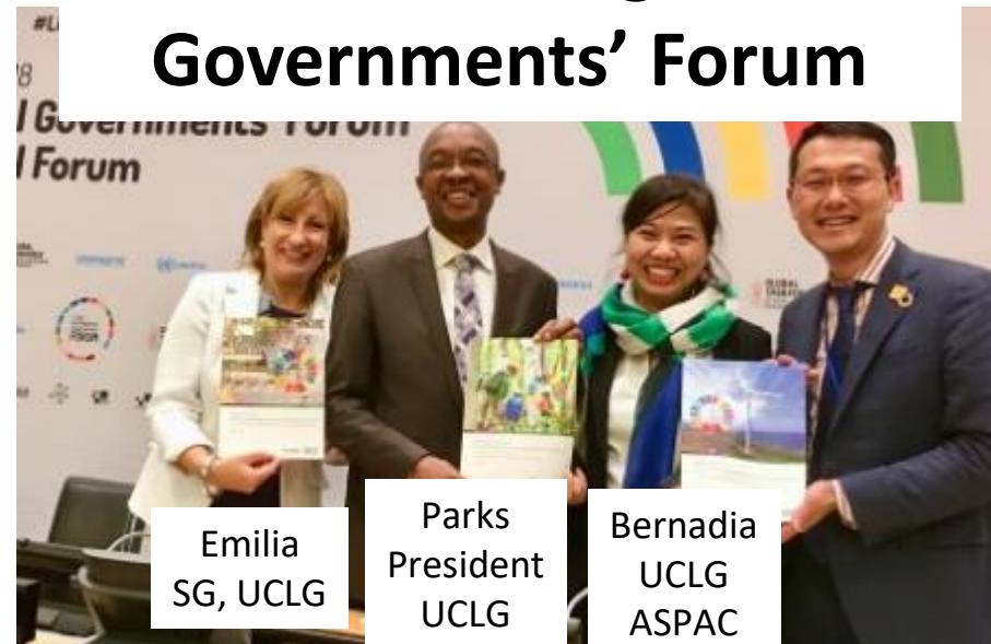
Emilia SG, UCLG