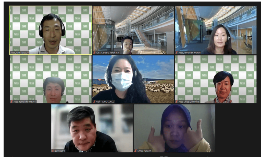
JCM: Joint crediting mechanism