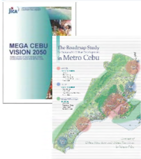
Metro Cebu development vision & roadmap: Formulated with support from Yokohama & JICA

integrated approach from planning to realization