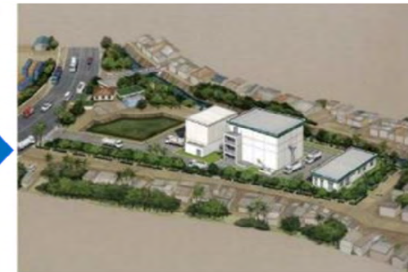
Project for the Septage Management of Metro Cebu Water District: Grant-in-aid through collaboration with local government