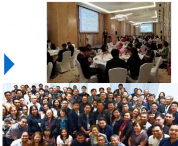
Metro Cebu Urban Development Forum