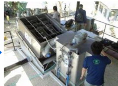
JICA support for Japanese SMEs' overseas business development (Demonstration test of sludge dewatering system by Amcon Inc., a Yokohama-based SME)