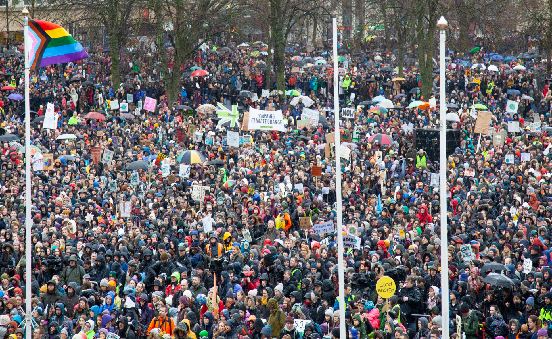
The view from City Hall!