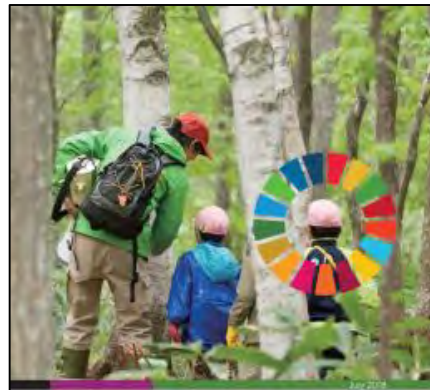
Shimokawa Town the Sustainable Development Goals Report —The Shimokawa Challenge: Connecting people and nature with the future— 2018