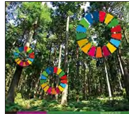
Hamamatsu Voluntary Local Review Report "Hamamatsu, a creative city built on collaboration, giving into the future" 2019