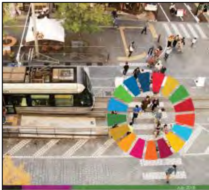
Toyama City the Sustainable Development Goals Report —Compact City Planning based on Polycentric Transport Networks— 2018