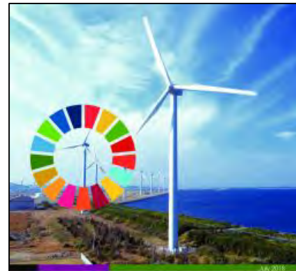
Kitakyushu City the Sustainable Development Goals Report —Fostering a trusted Green Growth City with true wealth and prosperity, contributing to the world— 2018