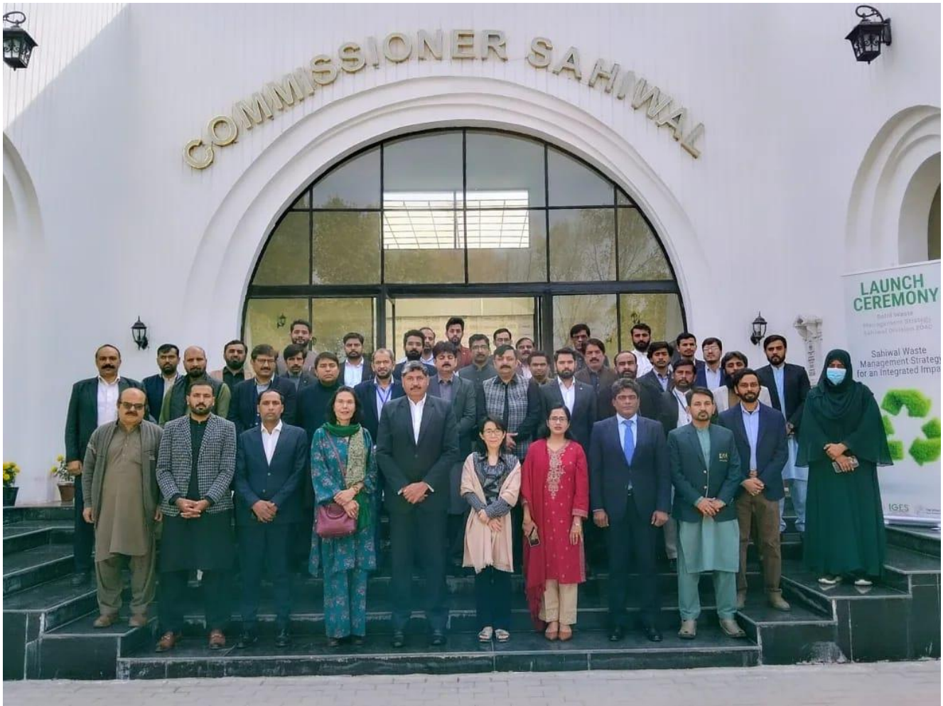
Group Photograph — Launch Ceremony, Sahiwal Division