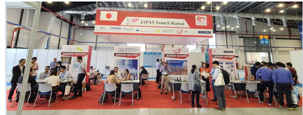
Business matching event