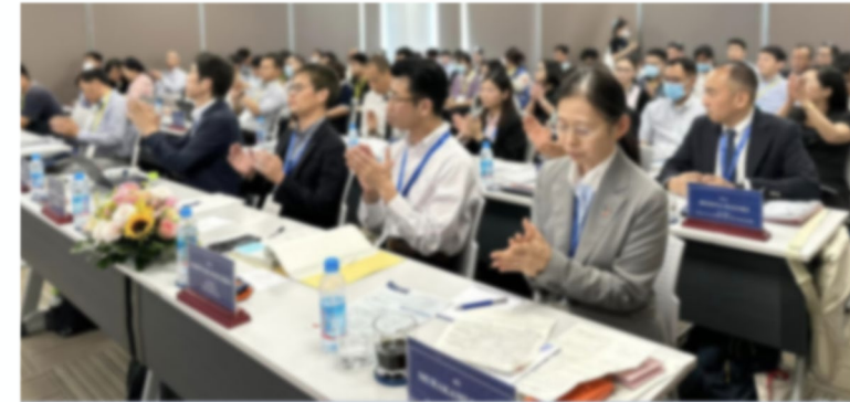
Environmental Technology PR Seminar