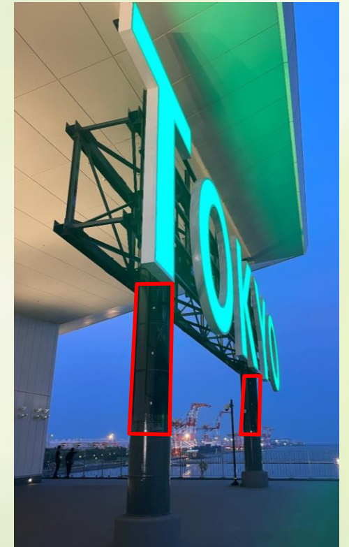
Ongoing pilot project at Tokyo International Cruise Terminal