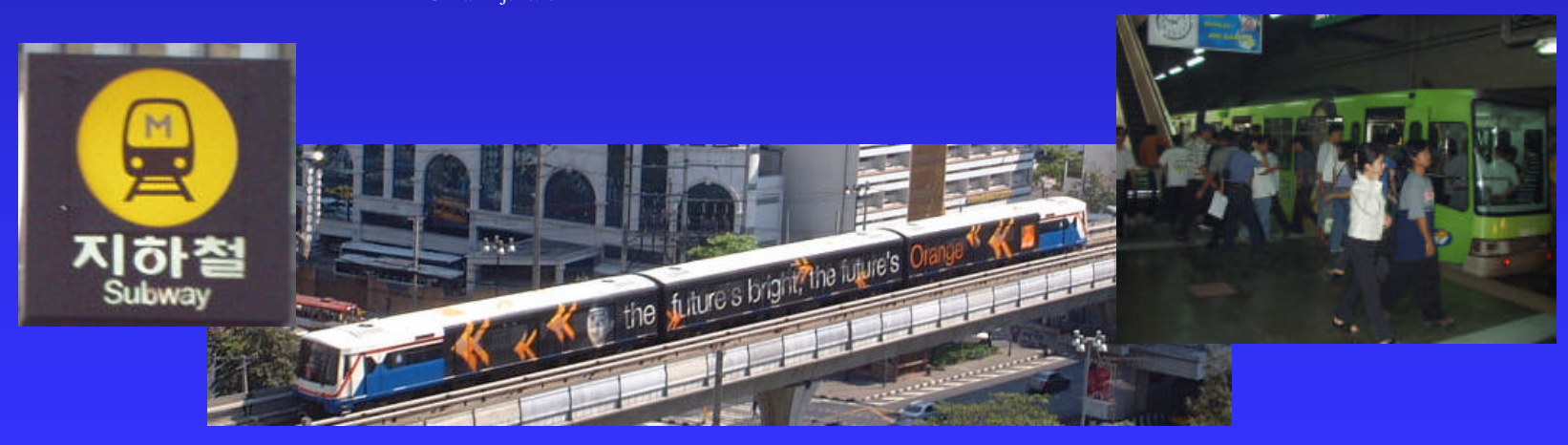
Manila Policy Dialogue on Environment and Transport in the Asian Region, 16-17 January 2004, Manila, Philippines