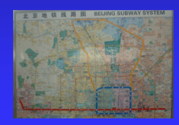
Manila Policy Dialogue on Environment and Transport in the Asian Region, 16-17 January 2004, Manila, Philippines