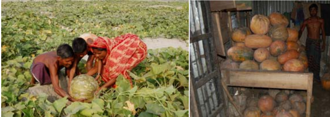
Figure 5. On the left, the pumpkins are being grown on char land. On the right, the pumpkins stored under room conditions.