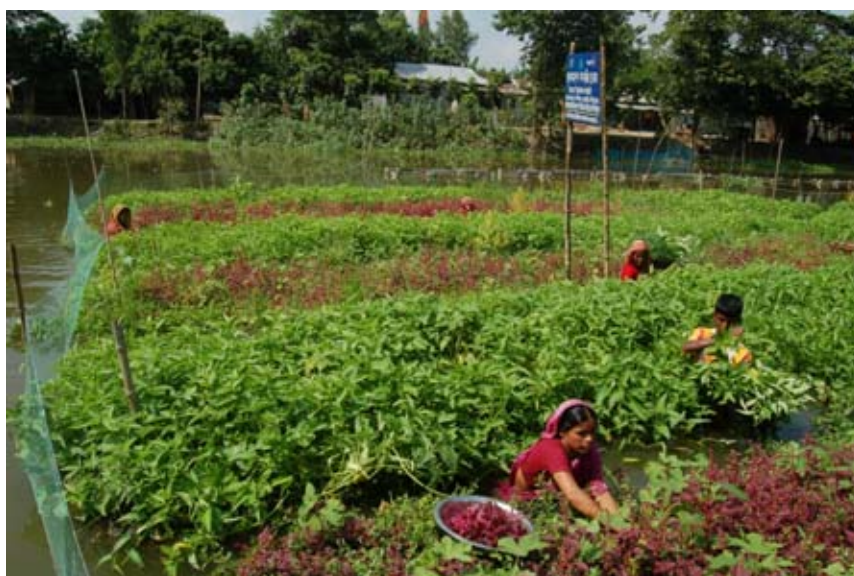
Figure 4. Floating vegetable garden in full growth.

The floating bed can be made by fresh water hyacinth that keeps the bed afloat while providing nutrients to the plants grown on it. The process involves preparation of a raft with dimensions of 8 m long and 1 m width with the help of water hyacinth. The soil is spread on the top and seeds are sown. Depending on the decomposition rate of water hyacinth, the bed needs to be replaced once in a year. The replaced bed could be used as compost elsewhere such as rice fields. Different vegetables, including okra, guards, onions, and pumpkins, were tried with good success.