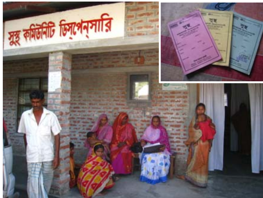
Figure 15. The dispensary in a multipurpose refugee shelter.

which include boats, fodder, food and medicines. Our interviews with a early warning team member indicated that they are well aware about where vulnerable people live in their village, how to handle the victims, and what kind of priorities to be made in the wake of a disaster.