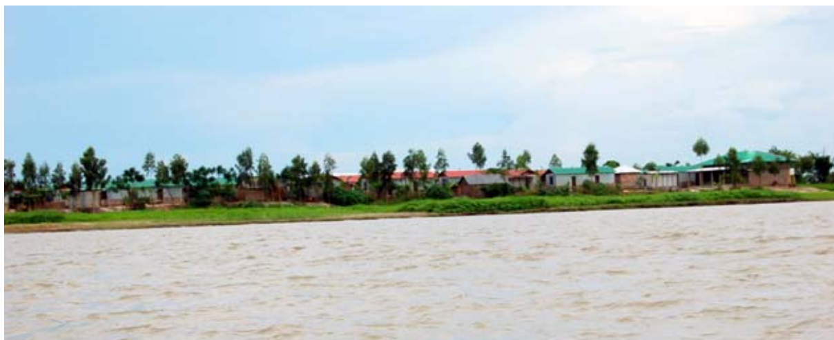
Figure 16. The cluster village saved lives and assets during 2007 floods.