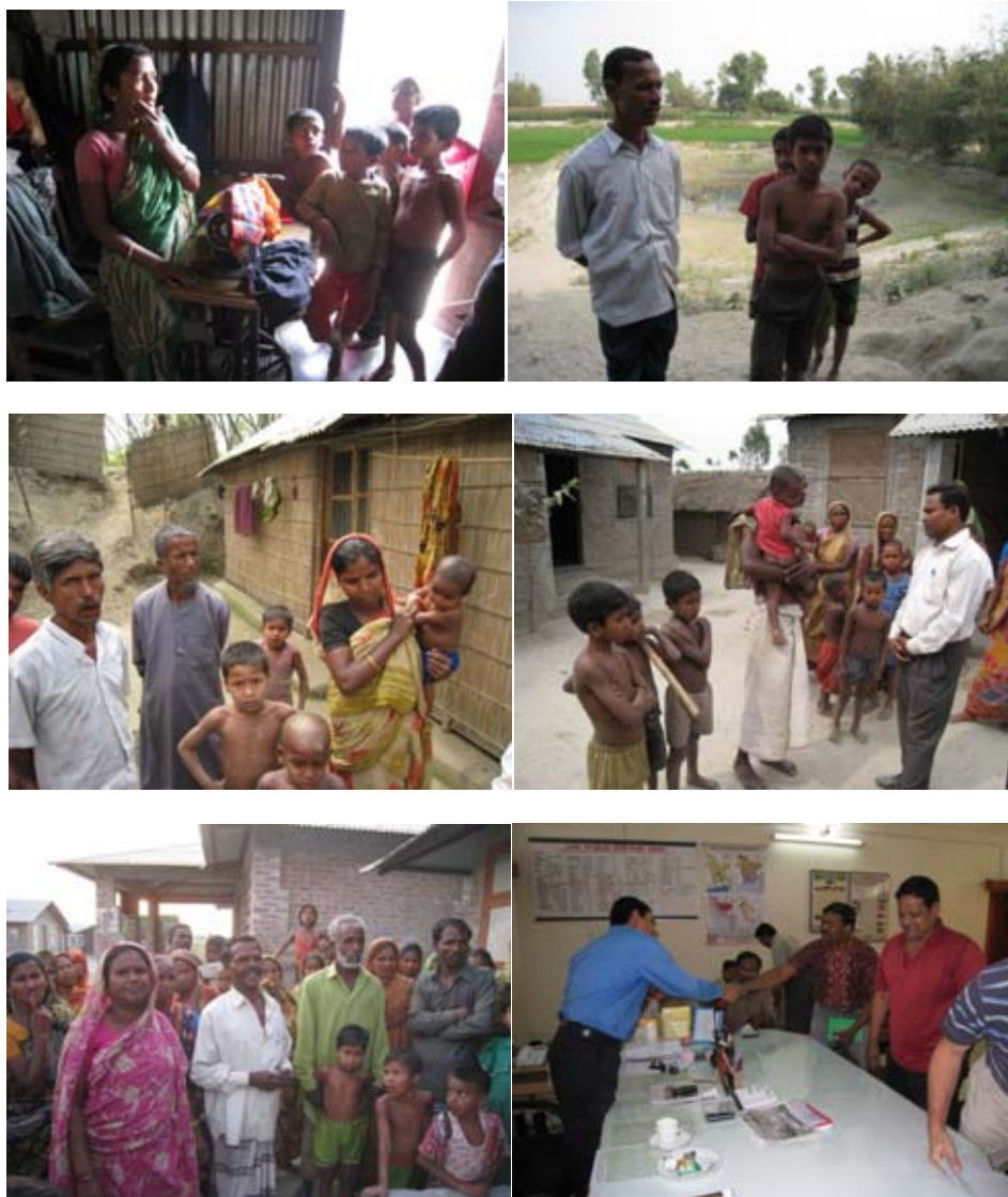
Figure Annexure I. Interviews with different stakeholders.

The selected case study of the APFED Golden Prize awarded project on Disappearing Lands was carried out in a consultative manner under the collaboration of the Institute for Global Environmental Strategies (IGES), Japan and Bangladesh Center for Advanced Studies (BCAS), Bangladesh with field level support from Practical Action, Bangladesh (PAB).