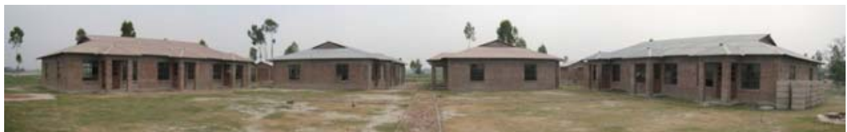
Figure 14. One of the multipurpose refugee shelters constructed by Practical Action.

The multipurpose refugee shelters consist of a dispensary, a school, facilities for vocational training, sheds for stalling cattle, storage facilities for storing valuable items and food during floods and cyclones, designated area for cooking, safe drinking water, and separate rest rooms for men and women. The multipurpose refugee shelters are constructed at such a location that they can be easily accessed by road. Practical Actions has constructed three such multipurpose shelters which are implemented by three different collaborating local NGOs SKS Foundation, AKOTA, and GUK.