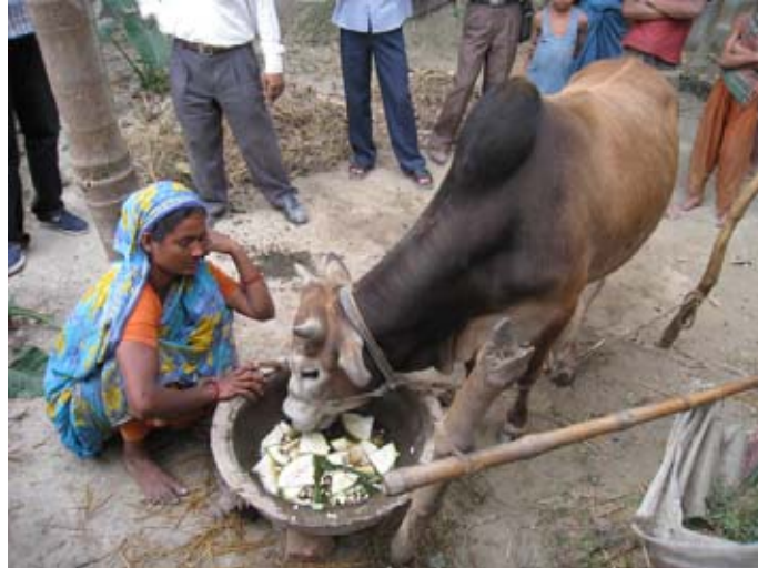
Figure 9. Beef fattening: Feeding bull a special diet for faster growth.