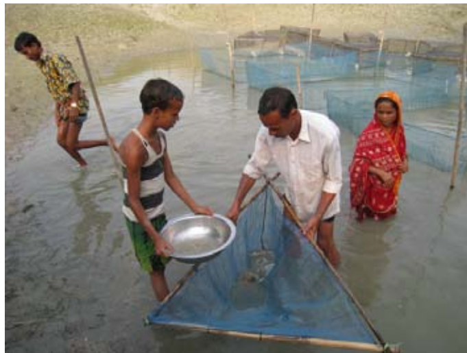
Figure 7. Cage fisheries provide flood proof solution to capture fisheries in flood prone areas of Bangladesh.

Practical Action (PA) has provided necessary training to 20 farmers in the first year of the project and by the end of the project the number of interested farmers has grown multiple folds who adapted the cage fisheries on their own.