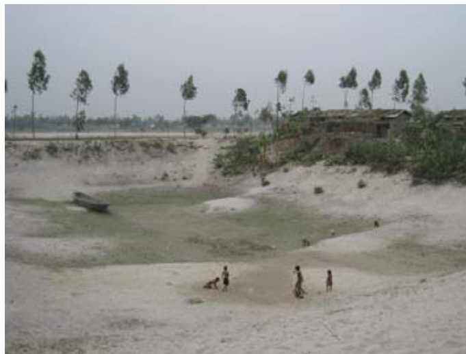
Figure 8. The community pond dug in the cluster village (picture during dry season).

The community based fisheries essentially involve making a pond management committee with representation from each household. A roster is prepared indicating the responsibilities of each household on what to do when. Efforts would be made to spread the burden and benefits equally across all the households involved in community fisheries. About 96 families in a cluster village involved in community based fishery management.