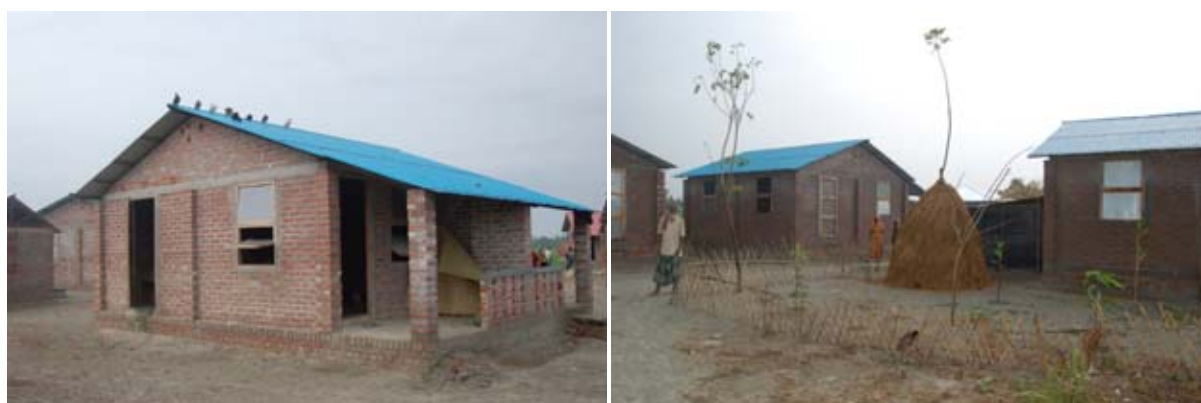
Figure 3. Houses in one of the cluster villages built by the Practical Action.

In addition to residential houses, each cluster village has a shelter for community activities, petty shops run by the residents, water and sanitation facilities, a pond for community fishery, and a boat for commutation during flood season. As of writing this report, nearly 342 families have moved into the cluster villages. Some cluster villages have biogas plants and solar power panels to provide cooking and lighting facilities. Two cluster villages have schools within the cluster village.