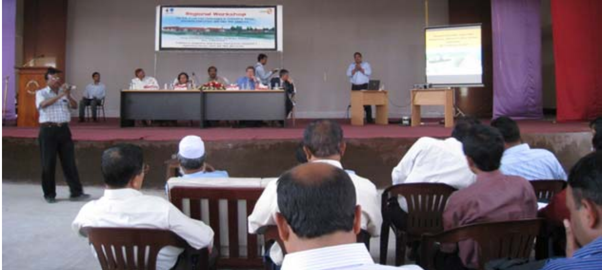
Figure 17. A national level workshop organized by the Practical Action to disseminate the outputs of the project.