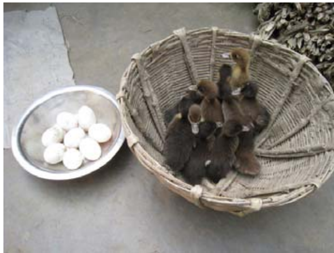
Figure 10. Duckery being practiced by the beneficiaries.

Ducks are better adapted to flood conditions than the chicken. Keeping this in view, the Practical Action has promoted the duckery in the Disappearing Lands Project. Under poultry component, 5 ducklings were given to each beneficiary. The benefits obtained by the beneficiaries are listed at the end of the section.