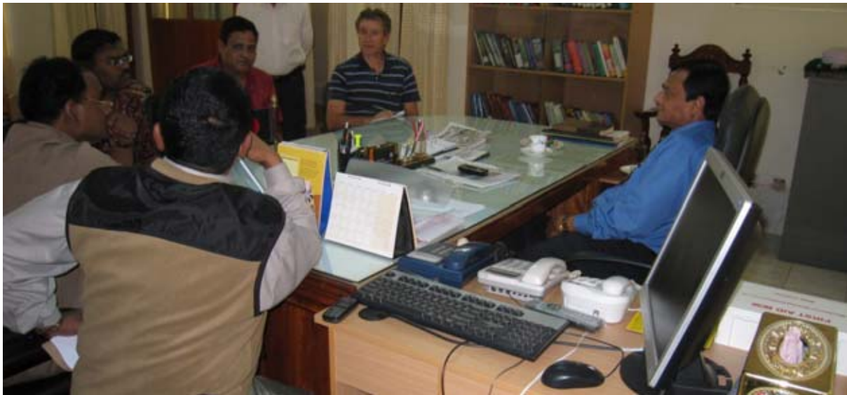
Figure 18. The APFED evaluation team discussing with the local government official. The project provides several lessons useful for taking up similar activities or even to scale up.

The Disappearing Lands Project provides us a good example of how small ideas can transform the lives of rural people living under stress. The project could generate significant benefits those will last longer. Much of the success of the project could be attributed to the effectiveness with which ideas were identified and implemented. The practices were timely, location and problem specific, targeted to the affected communities, and produced significant benefits, as demonstrated by the additional income generated, assets such as cluster villages and multipurpose shelters constructed, and improved capacities and awareness achieved. The project was successful in instilling sufficient interest and ownership among the beneficiaries.