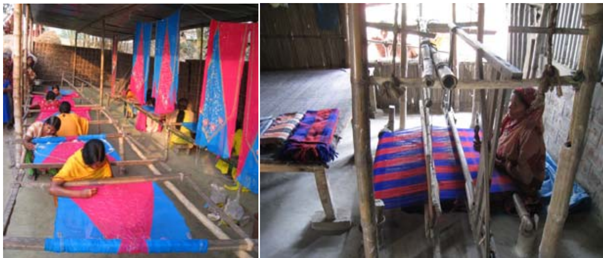
Figure 13. Training on Handicrafts WAS imparted to adolescent girls, school dropouts and women on embroidery and weaving winter cloths.

Practical Action has provided different kinds of handicrafts training to rural adolescent girls, weavers, and others with an aim to raise their income levels. The training included hands-on training on embroidery (250 adolescent girls), master tailor training (185 persons), gift-wrapping, and weaving. Some beneficiaries are rural adolescent girls who are also school dropouts due to poor economic conditions.