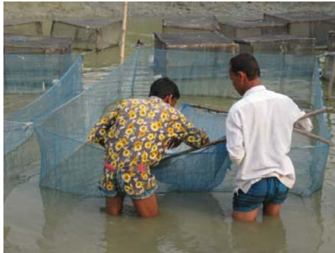
Figure 6. Cage fisheries: Open cages for growing large fish. Observe the floating cages in the background.