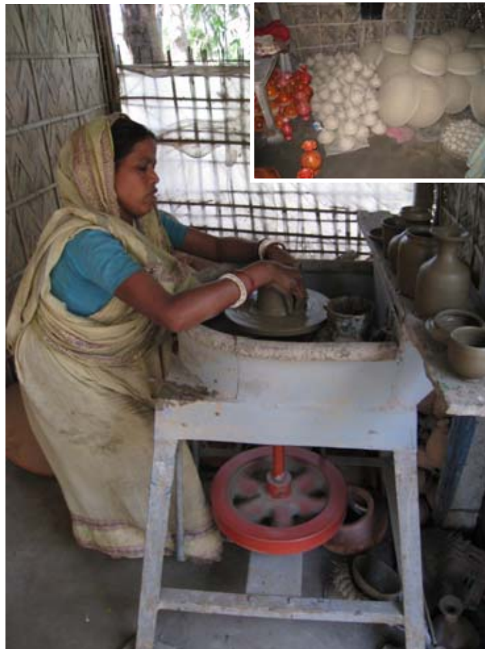
Figure 11. Improved pottery wheel provided by the Practical Action.

a furnace/kiln that will help them fire the clay uniformly and even during rainy season when drying and firing clay becomes difficult.