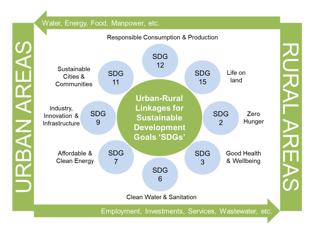
Figure 1. Conceptual diagram of urban-rural linkage with sustainable development goals (SDGs).

Urban and rural regions exist as interdependent entities connected through various spatial and sectoral flows (refer to Figure 1). Rural regions serve as centers for key resources such as food, water, energy, and labor, which are crucial for urban regions. Similarly, urban regions provide opportunities for rural dwellers, creating markets for agricultural products, and becoming sources of temporary employment and shelter. Urban–rural linkages can be defined as the direct (and two-way) flow of resources between geographically dispersed urban and rural areas [10,29,30]. Enhancing the continuity and connection between urban and rural regions is crucial for reducing poverty, achieving a satisfactory level of access to and management of resources, and at the same time maintaining the ecological and cultural diversity that is essential for regional resilience. On the other hand, unplanned and rapid urbanization is attributed to the loss of agricultural land, wetlands, and forest [25,31].