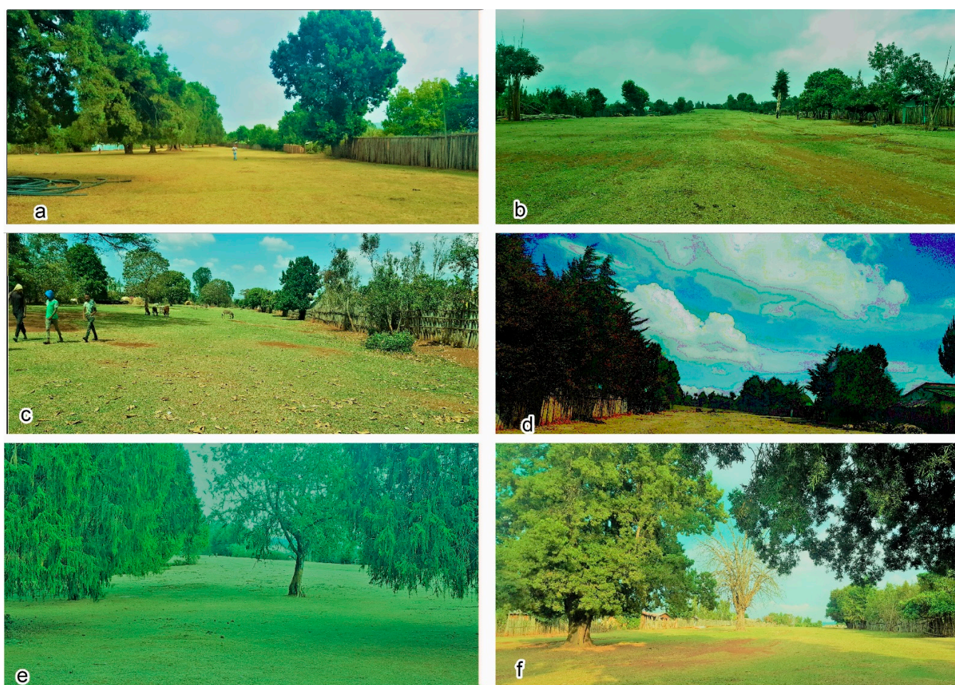
Figure 3. An overview of the selected Jefoure roads sites: (a) Inagera, (b) Selam, (c) Cheret, (d) Aegeera, (e) Yadazer Yezhira, (f) Gehared (field survey, February 2020).