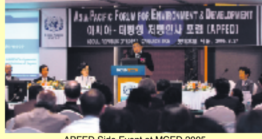
APFED Side Event at MCED 2005

APFED II consists of several key components including policy dialogues, knowledge management and showcase projects. At the APFED II meeting scheduled in Bogor, Indonesia from 21- 22 November 2005, APFED members will review proposals and discuss the modalities for implementing APFED II activities. APFED II activities