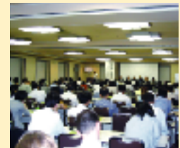
IGES/NIES open symposium 2004