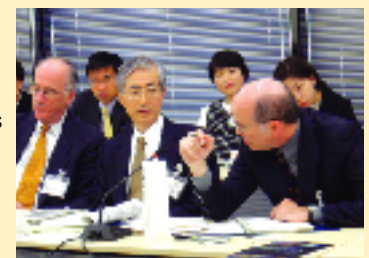
IGES/RFF Workshop on Climate Policies in US & Japan