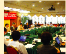
Asia-Pacific Dialogue on Climate Regime beyond 2012 -Beijing