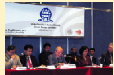
COP10 side event: Mainstreaming Adaptation in Development