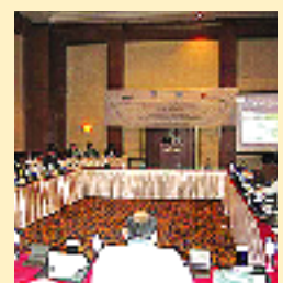
Workshop on Financing Modalities for the CDM