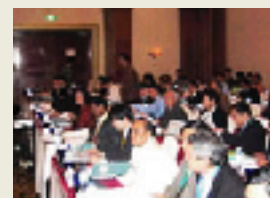
Workshop on Financing Modalities of CDM