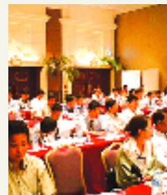
Workshop in Cambodia

The CDM programme has a step-by-step plan of capacity-building through various workshops and training for both the government and private sector in the host countries. In its first year, FY2003, the CDM programme focussed on raising the awareness of the CDM and disseminating information to relevant people. In FY2004, it conducted training to improve the technical expertise necessary for CDM project formulation by using model cases - actual CDM project candidates as case studies provided by the Global Environment Centre Foundation (GEC). Besides further support on project formulation, it has started training on the approval procedure for CDM projects in FY2005.