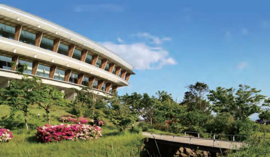
Institute for Global Environmental Strategies (IGES) Hayama Headquarters <Design and Supervision by Nikken Sekkei Ltd.>

Chair, Board of Directors Institute for Global Environmental Strategies (IGES)