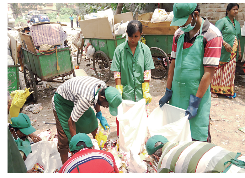
Galvanising efforts for sustainable waste management and resource efficient society