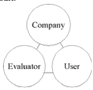
Figure 2: The three players in the corporate evaluation system.

The two processes of evaluating a corporation and then its products are fundamentally different in nature. While product evaluation is measured with a set of indicators on environmental efficiency, various ideas exist on implementing corporate evaluation—some attach more importance to past records than future plans or vice versa. There seems to be no one complete method available yet for effectively evaluating corporations. Under these circumstances, an integrated evaluation system needs to be formulated with the participation of companies, evaluators, and users who will then take action based on the result.