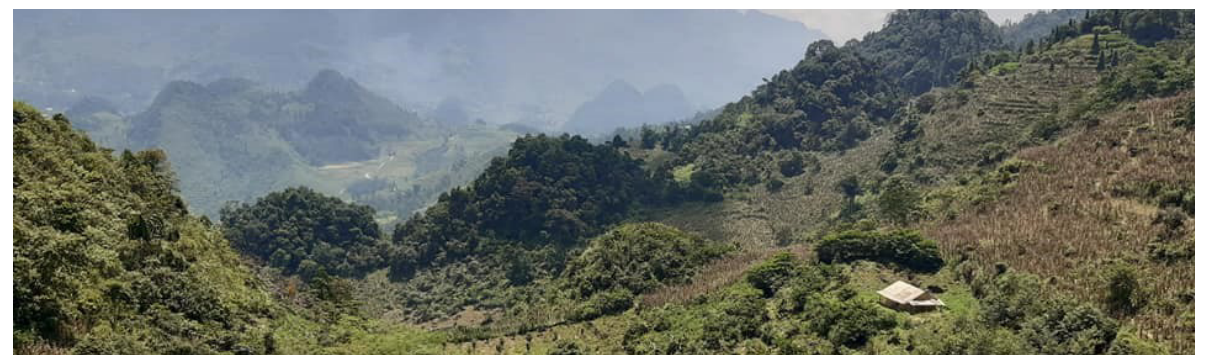
Restored landscape in Simacai district, northern Vietnam

In 2019, the revised Vietnam Forest Law included provisions on mixed-species forest restoration and on community rights in sacred forests. This was enabled after years of activism and advocacy campaigns building on the successes demonstrated by community-level pilot projects. As such, a combination of a new legal frame and bottom-up actions from local communities will help realise transformative change in rural land governance and promote sustainable resource use practices towards sustainability.