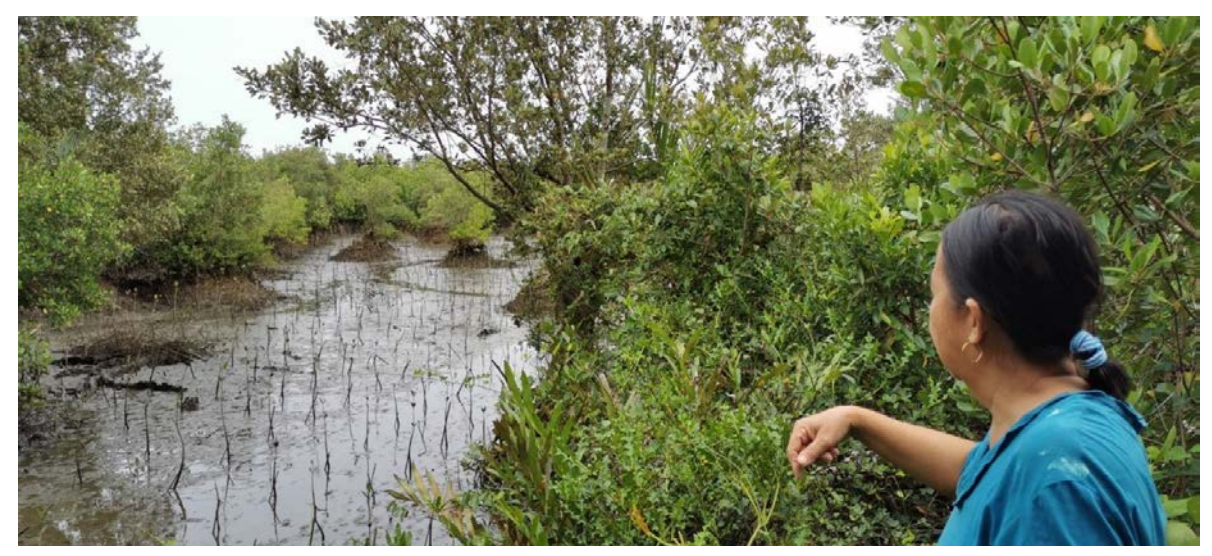
Mangrove restoration on abandoned fishponds

The impact of COVID-19 on the local community was not particularly significant, with healthy mangroves that provide a source of livelihood and a diverse range of food, including fish and 'nipa' fruit wine. Moreover, social and financial capital among the local people nurtured through mangrove restoration activities helped them proactively respond to the crisis. This included their cooperation in adhering to government protocols on infection prevention and a communal financing mechanism provided by the Alitas Farmers Association. The nationwide recovery of mangroves, and sharing of responsibility between communities and governments for conservation and sustainable use of mangroves, illustrate a transformative change pathway for sustainable mangrove management in the Philippines.