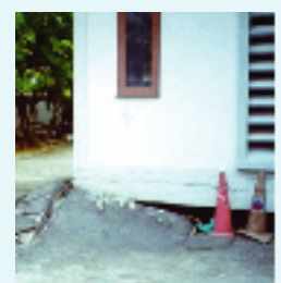
Land subsidence in Bangkok

To ensure policy relevance of the research and to receive feedback from various stakeholders, stakeholder meetings have been organised in the respective case-study cities, inviting policy-makers, academia and NGOs.