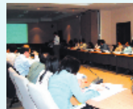
Stakeholder meeting in Bangkok