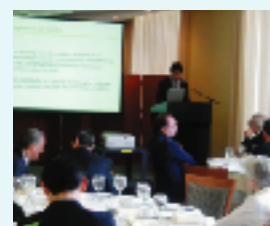
Presentation at CSD13